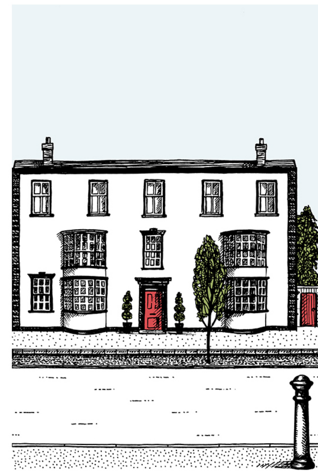
High Street 9