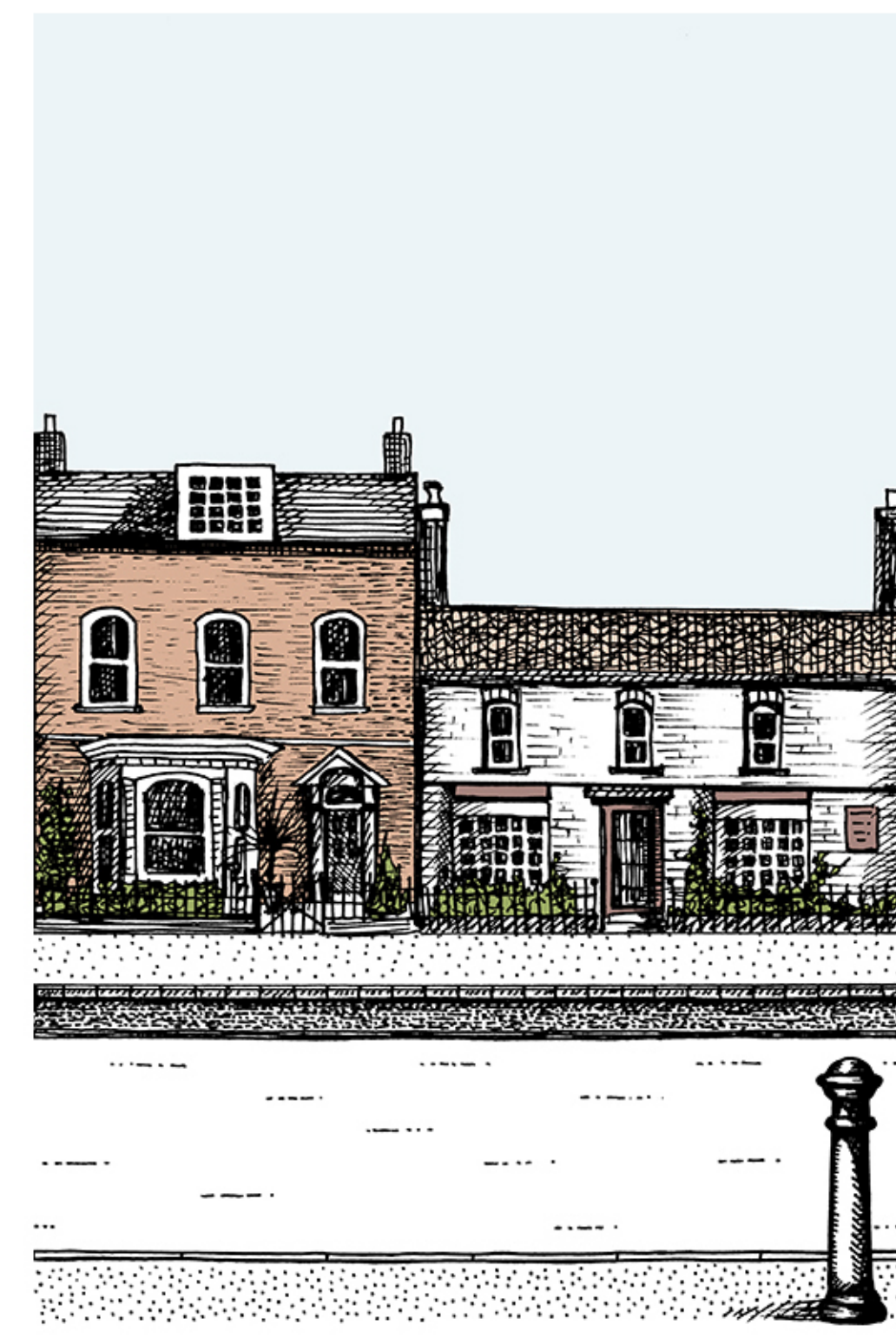
High Street 4