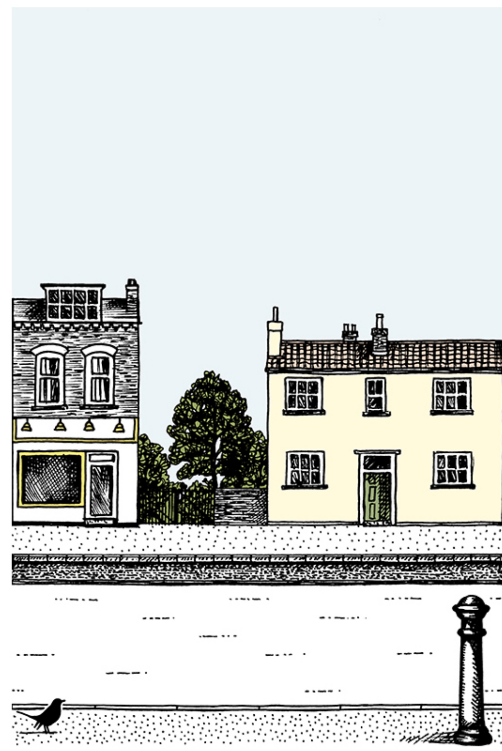
High Street 8