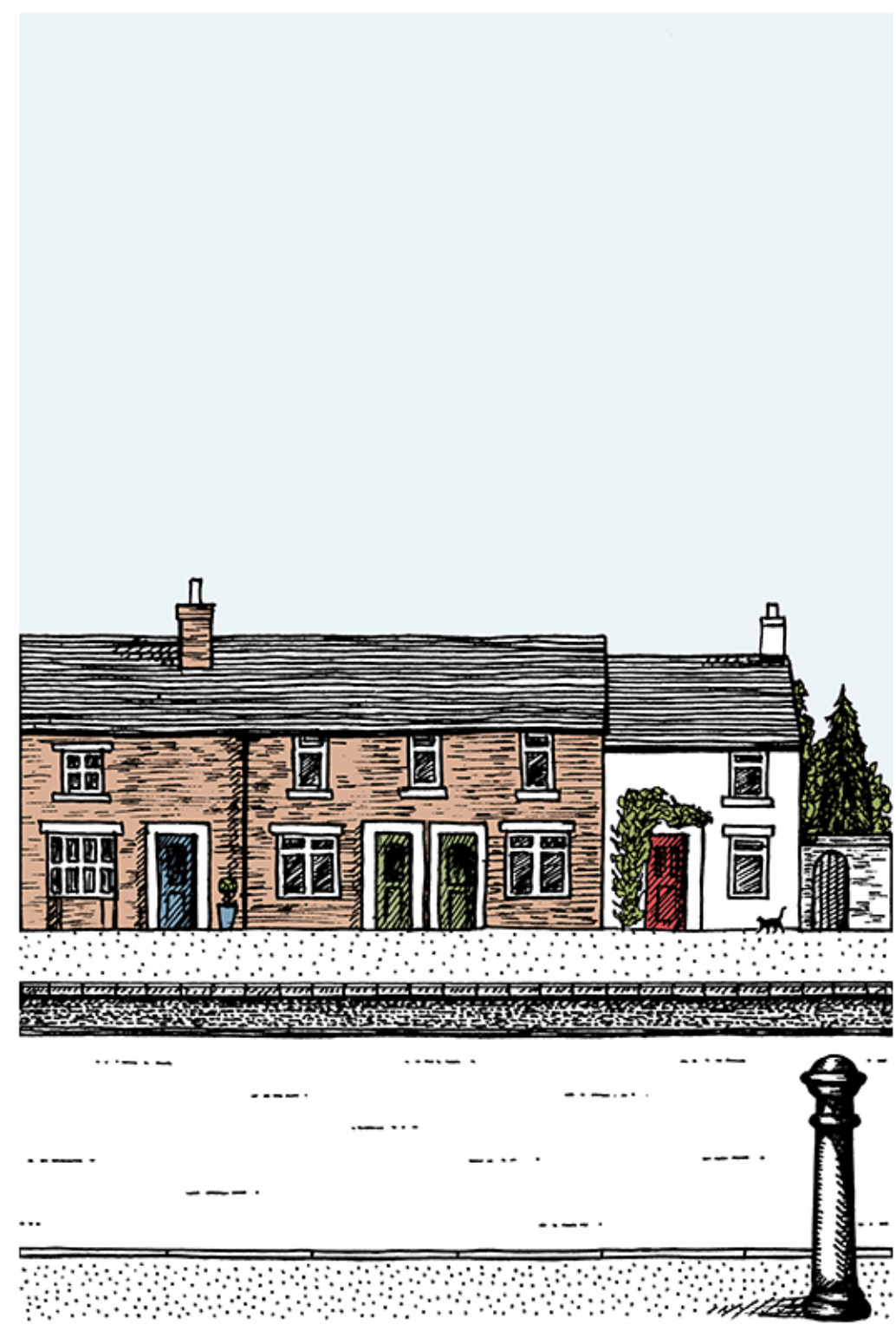
High Street 6