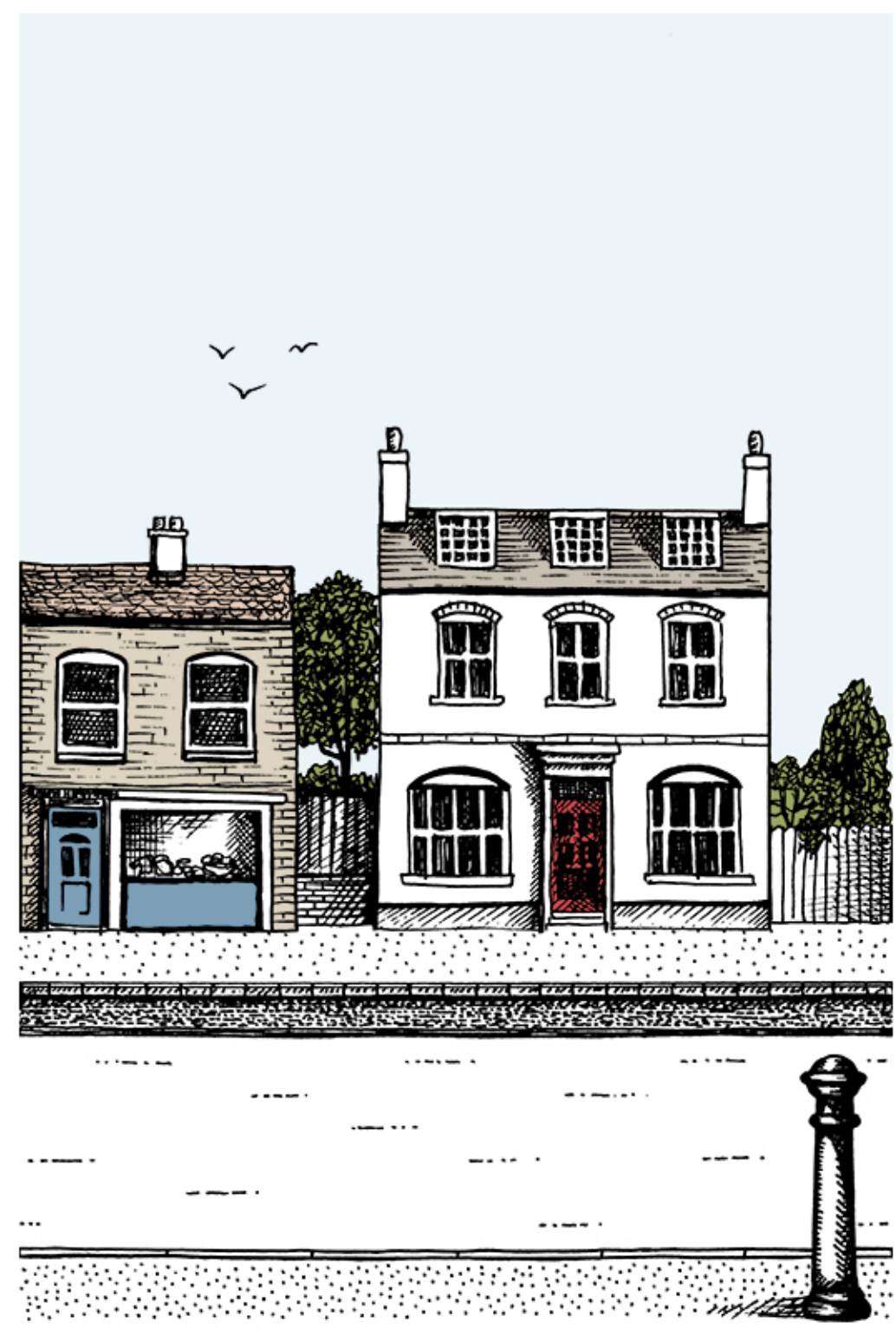
High Street 1