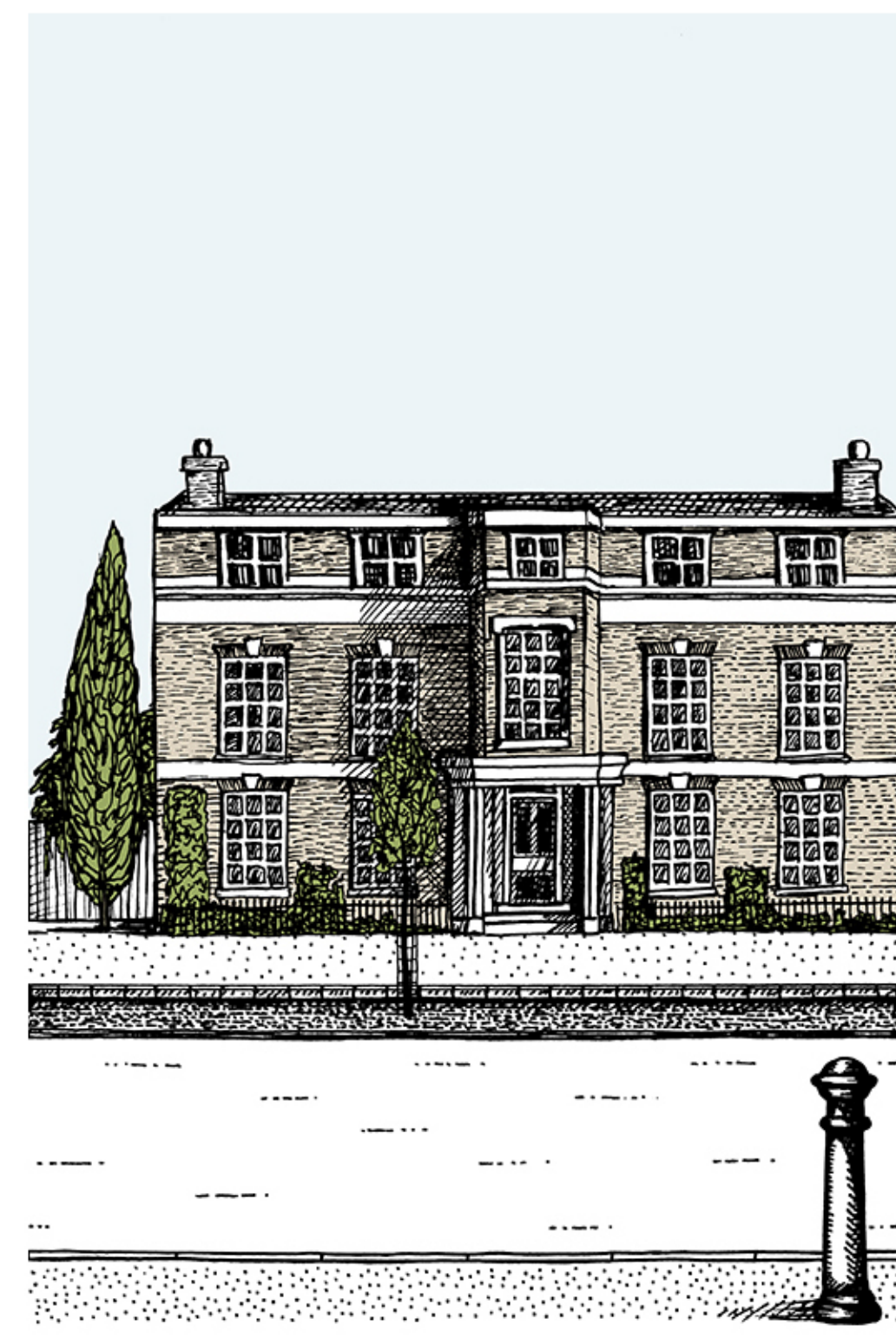
High Street 5