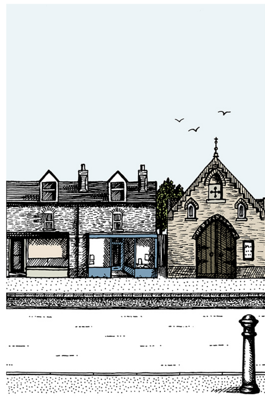
High Street 3