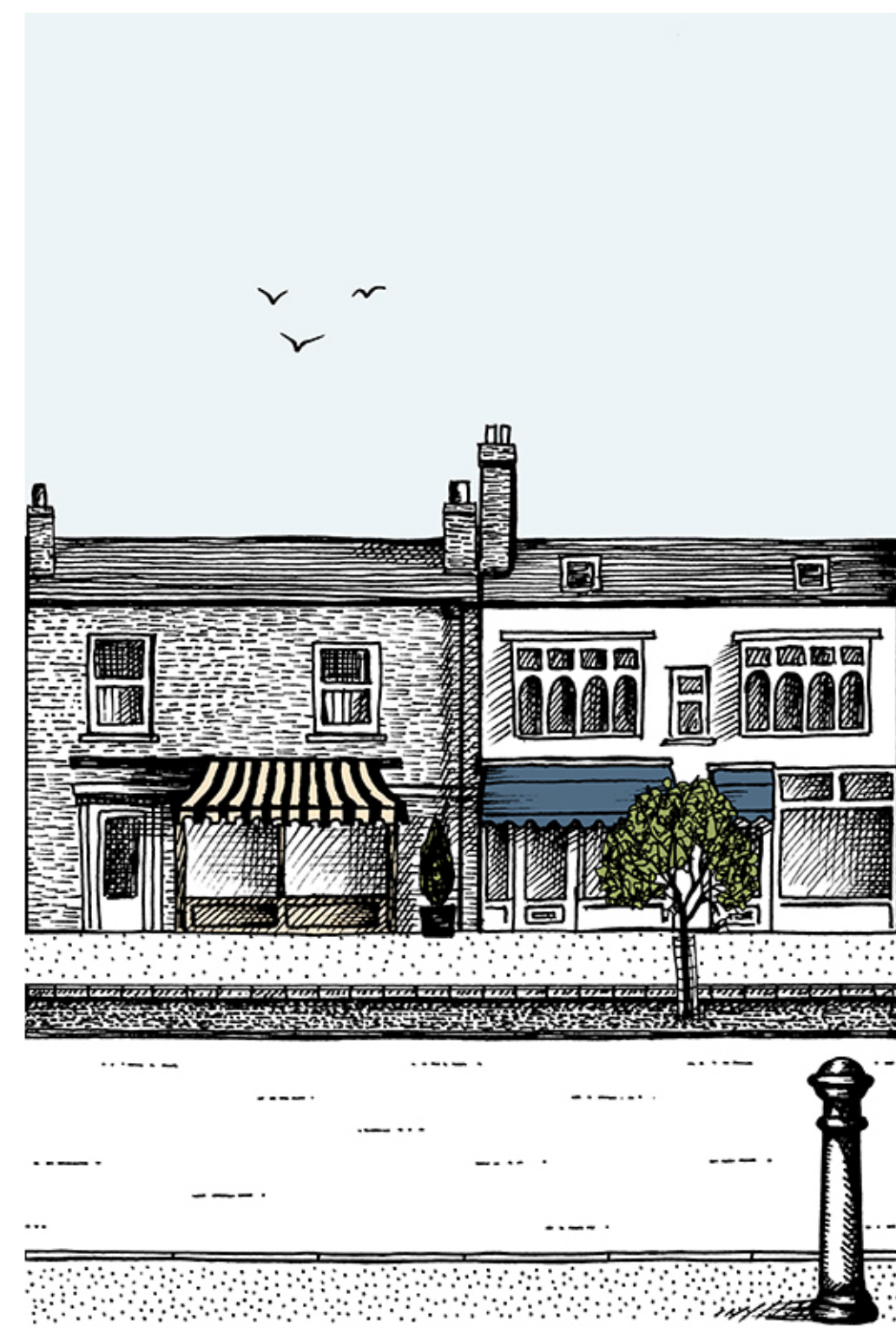
High Street 10