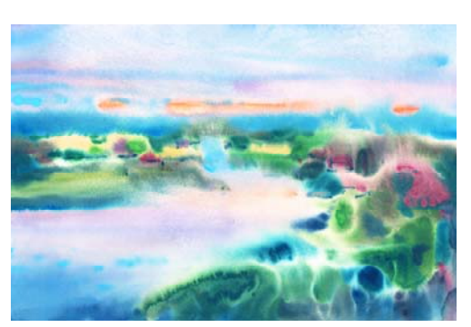
Riverbank 3m x 4.5m