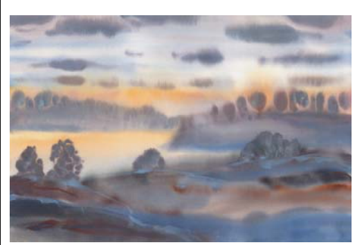
Twilight 3m x 4.5m