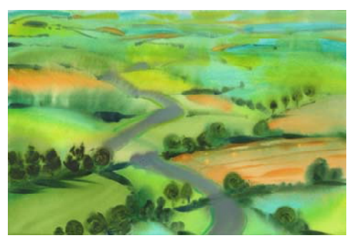
Yorkshire Patchwork 3m x 4.5m