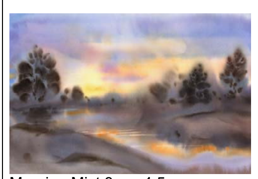
Morning Mist 3m x 4.5m