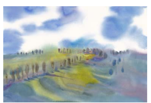
Toscana 3m x 4.5m