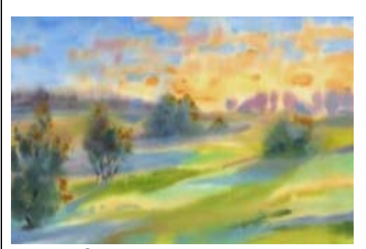
Dawn Chorus 3m x 4.5m