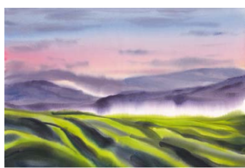
Heather: 3 x 4.5m