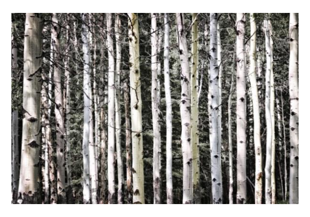
Birch Forest : Max print size 5000mm x 3000mm. Can be repeated to fit longer wall.