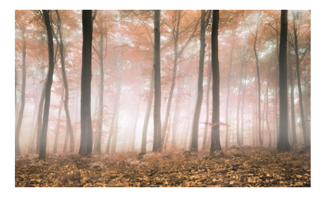
Copper Trees : Max print size 5000mm x 3000mm. Can be repeated to fit longer wall