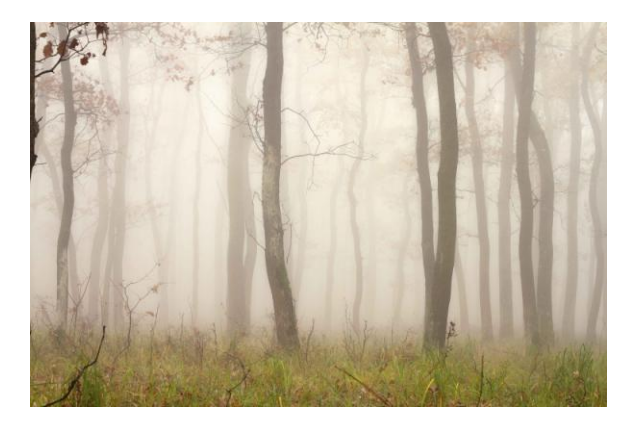
Misty Trees : Max print size 5000mm x 3000mm. Can be repeated to fit longer wall.